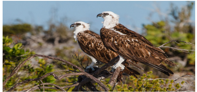
Female (larger) and male osprey.

Often, when I am wading the Mo and focused on fooling rising fish, I am startled by the whoosh of a diving osprey. A splashing of bird and fish often follows as the osprey pummels its five foot wings, rises skyward, turns the fish torpedo-wise, and flies off in the direction of its mate and babies. I know then that I am not the only fisher on the river, definitely not the hardest working one, and certainly not the most skilled. ■