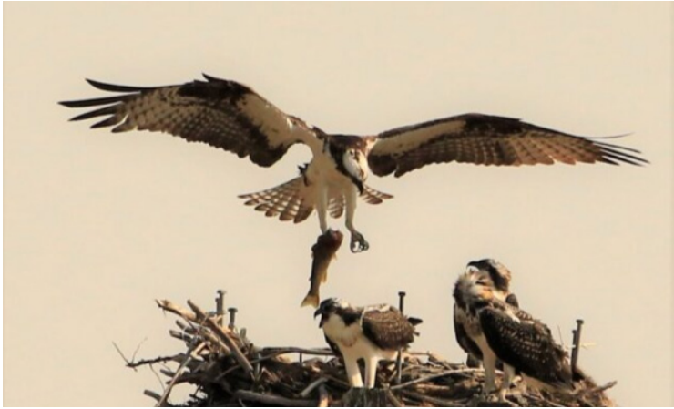
Osprey male delivering fish to mate and chick. West-side Helena.

Many Upper Missouri River users like to fish the Mo and some occasionally enjoy fishing all day for several days in a row. But how would you like to fish 10 or more hours a day for seven to eleven weeks in a row? Such is the work schedule of the male osprey, who is the sole breadwinner for his family of 1-2 fledglings from the time they hatch in the spring until their first flight in early fall. To deliver about 10 fish per day to the nest the male makes dozens of 30 to 100 foot dives into rivers and lakes. They succeed in grabbing a fish of with their sharp talons about every third dive. Meanwhile, the female osprey stays on the nest, protects the babies from predators (eagles, owls, raccoons), keeps them warm, and feeds them by tearing the delivered fish into bite size pieces.